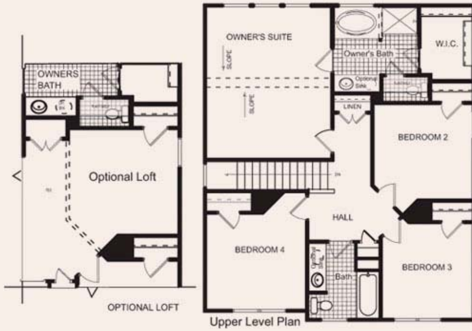
Upper Level Plan